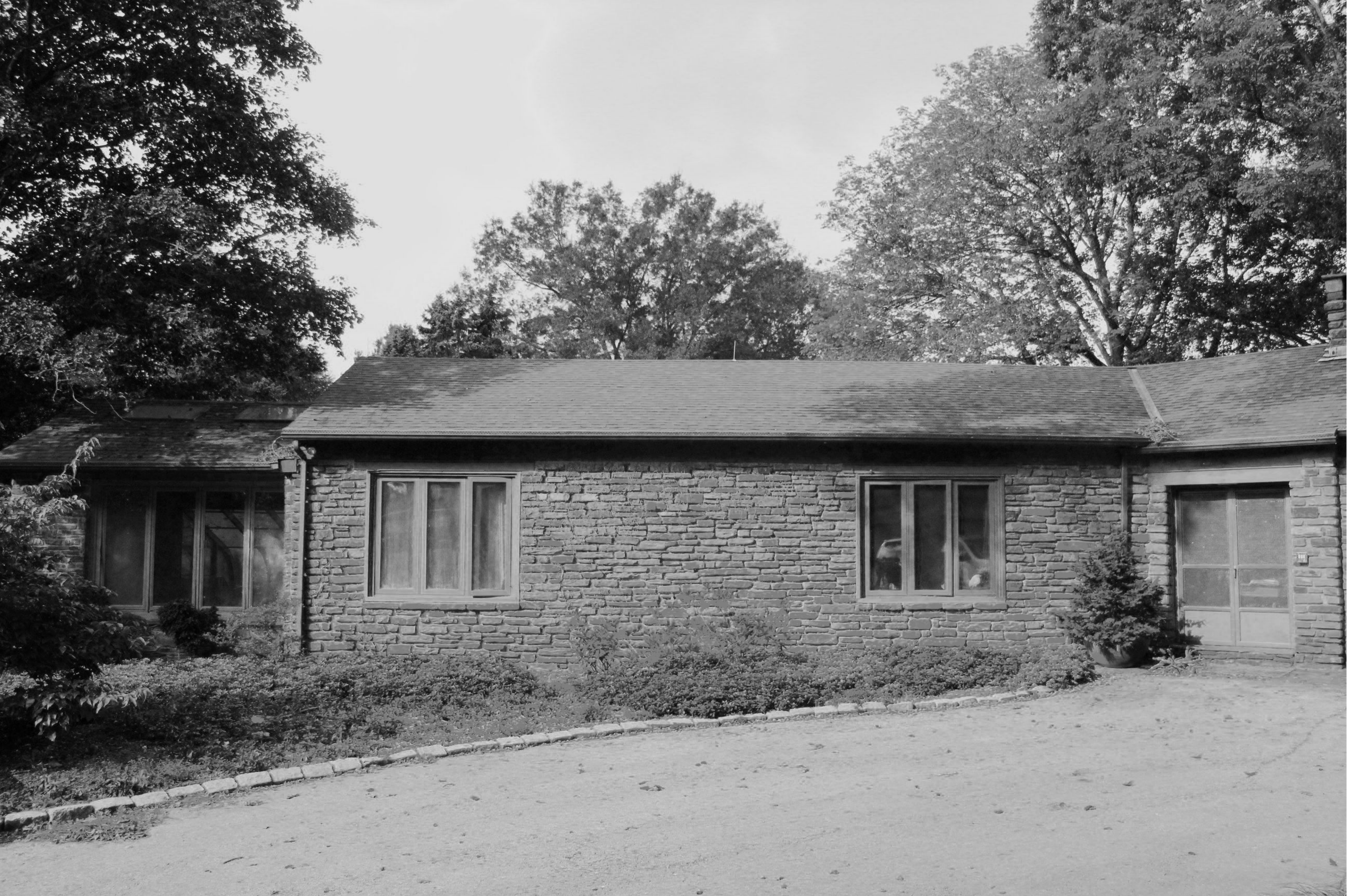
901 Mt. Lebanon Road_New Castle County_DE East elevation of bedroom wing looking west