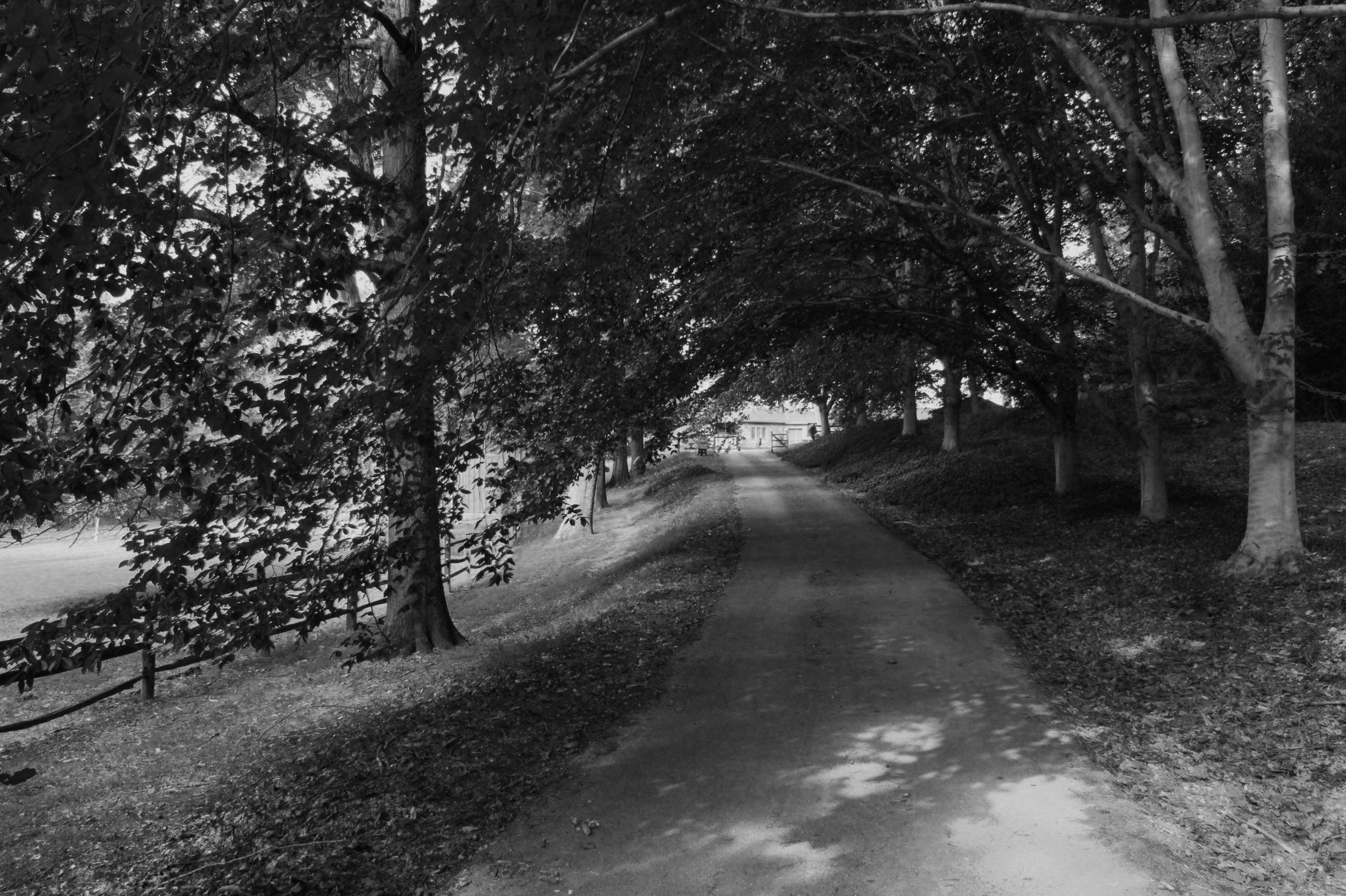
901 Mt. Lebanon Road_New Castle County_DE Environmental view of house, stable, pasture taken from Mt. Lebanon Road looking northwest