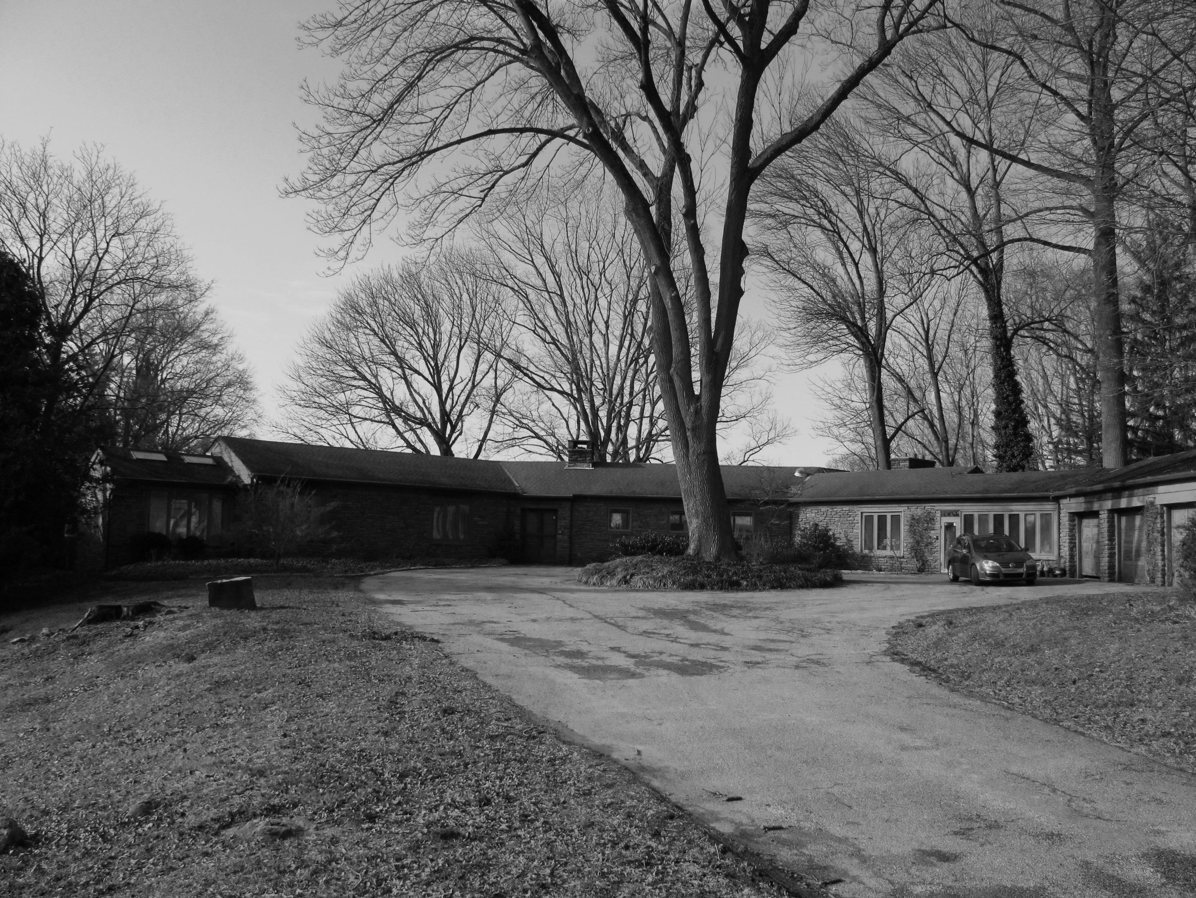
901 Mt. Lebanon Road_New Castle County_DE Perspective view of house on Mt. Lebanon Road side looking northwest (bedroom wing, living room, kitchen, garage, circle driveway) 03 of 39