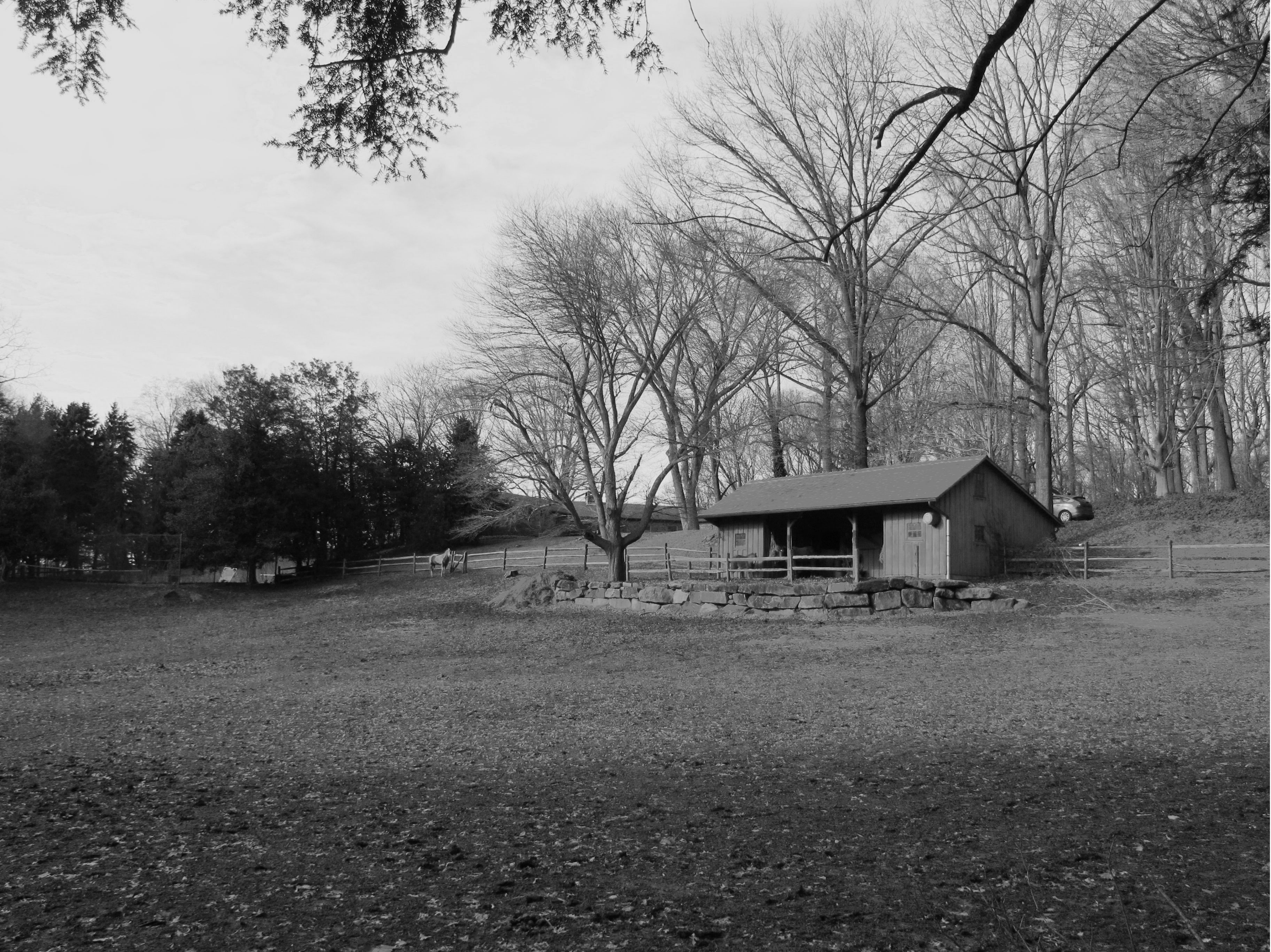
901 Mt. Lebanon Road _New Castle County_ DE Environmental view of house, stable, pasture taken from Mt. Lebanon Road looking northwest 01 of 39